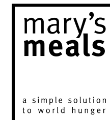
White and black alternative