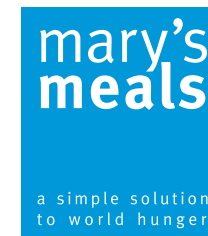
White text alternative